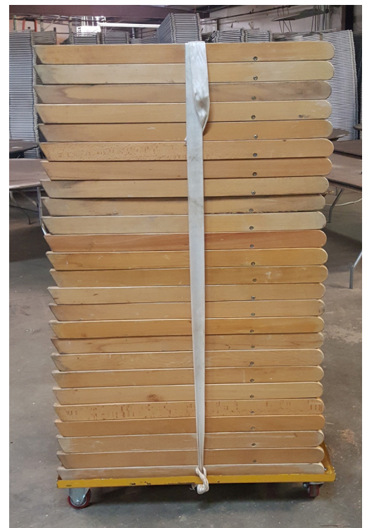
Shown with 25 wooden folding chairs.