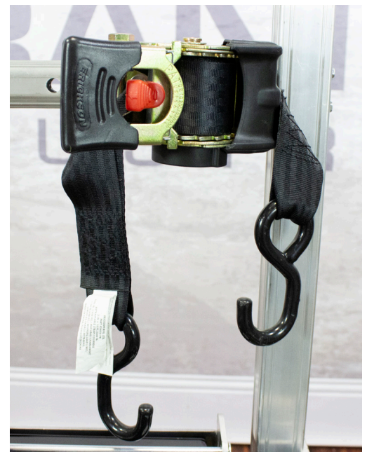
10'L x 2"W auto retracting ratchet strap.

RAPTOR HIGH PERFORMANCE ALUMINUM PRODUCTS