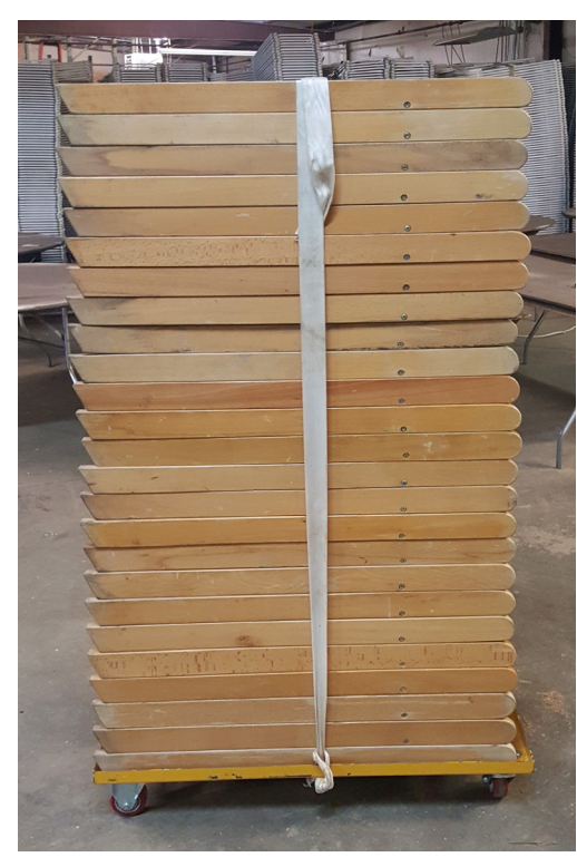
Shown with 25 wooden folding chairs.